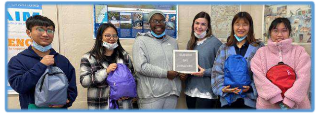
Blessing Bags made by KΔΠ students for the Gainesville homeless community.

In October, Kappa Delta Pi members hosted a “Pink Out Breast Cancer Walk”. We decorated the Brenau Mile here on campus, and set out to collect donations for their community project. The Brenau Community collectively donated over $200. Proceeds were used to shop for personal care items for the homeless community in Gainesville. Faculty and staff from The College of Education also supported the students by collecting items. Students were able to host an in-person event at the end of the semester where they created the Blessing Bags for the Gainesville homeless community. They included letters of encouragement in each bag that were created by 2 nd grade students at Fair Street Elementary & 5 th grade students at East Jackson Elementary.